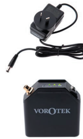
Power Pack & Charger